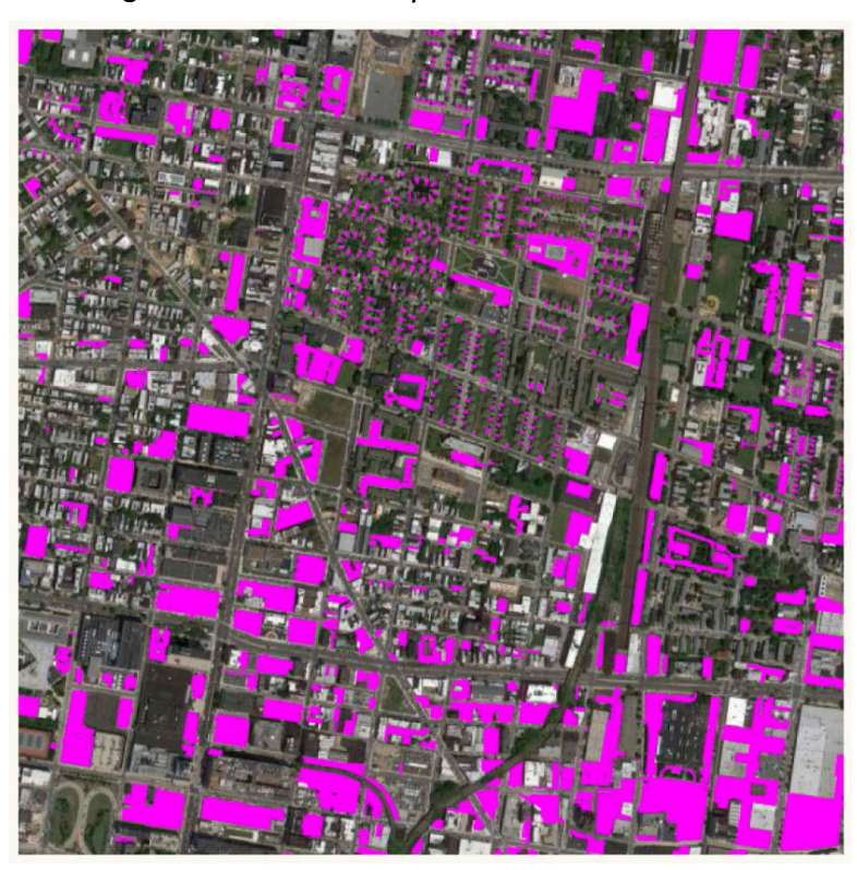
Image from the Research Institute for Housing America, "Quantified Parking: Comprehensive Parking Inventories for Five U.S. Cities."

Traced Surface Parking Landcover in Philadelphia