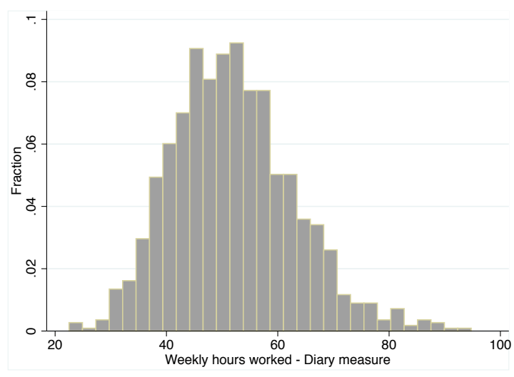
Figure 1: CEO weekly hours worked, diary measure

Notes: The graph shows the histogram of total weekly hours worked (built from actual diary data) by a sample of 1114 CEOs.